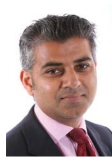
Sadiq Khan MP Parliamentary Under Secretary of State Communities and Local Government

Fire safety matters. Having a clear understanding of the risk that fire represents in your property will allow you to consider and put in place the right fire safety arrangements to protect not only the lives of your family and any guests that are staying with you, but also your property and your business enterprise.